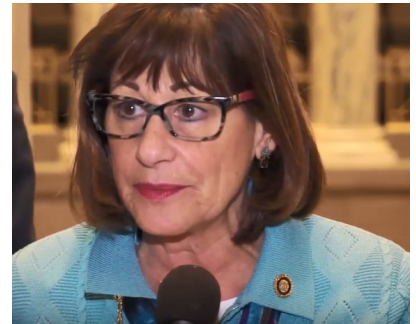
Senator Jill Schupp (D- St. Louis) is the primary Senate sponsor of 'Red Flag Gun Seizure' legislation in Jeff City.

'Red Flag Gun Seizure' legislation is far worse than a typical AR-15 ban or a universal gun registration bill, in that this legislation allows the government to confiscate every firearm that you own, before you've ever set foot in a court of law!